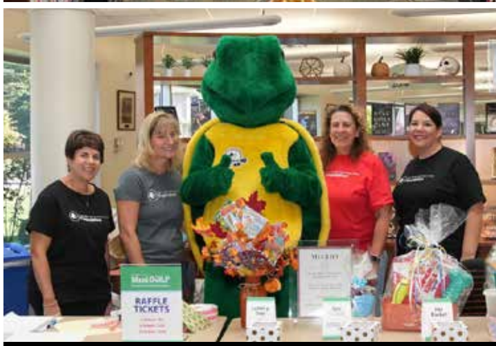
Top: Volunteers setting up Library Mini Golf Above: Foundation members (and Spike the Library Turtle) at the 2024 Mini Golf event