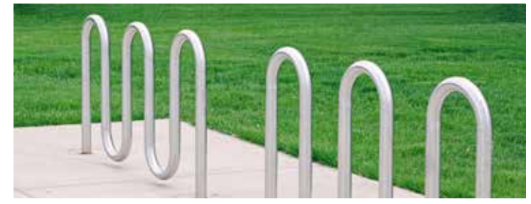
A new bike rack for the front of the library