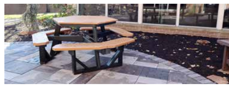
New picnic tables for the Pollinator Garden